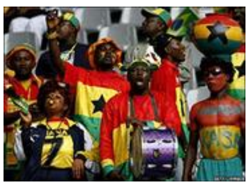
http://news.bbc.co.uk (Accessed 2008)