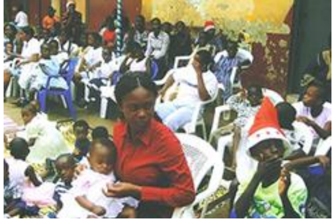
http://www.diasporaafricanforum.org/ (Accessed 2008)