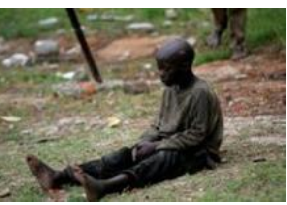
Adapted from: <u>http://streetchildafrica.org.uk</u> (Accessed 2008)