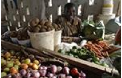
Original source: http://www.climatechoices.org.uk